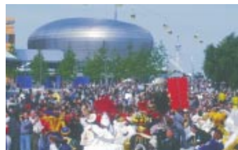
Jovial atmosphere on the Expo 2000 plaza

T-Mobil was not only active behind the curtains, but also supported the T-Digit project of its parent company, Deutsche Telekom. This giant, cube shaped exhibition object had been developing into a visitor attraction. Designed as a construction with four hyper-dimensional screens the Digit presented Expo information and transferred message from all over the world; for example, the Football EM in Belgium and The Netherlands, the Tour de France and the Olympic Games in Australia. As a